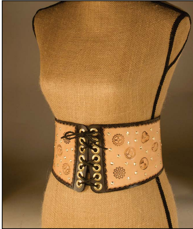
Artwork by George Hurst All designs are reproduced at 100% Page 1 of 1