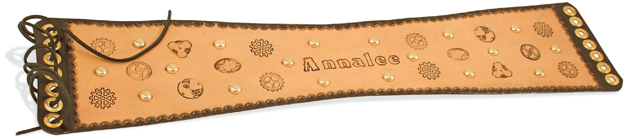
Artwork by George Hurst All designs are reproduced at 100% Page 1 of 1

1/2 of Belt Pattern Fold at Waist Size for Full Belt