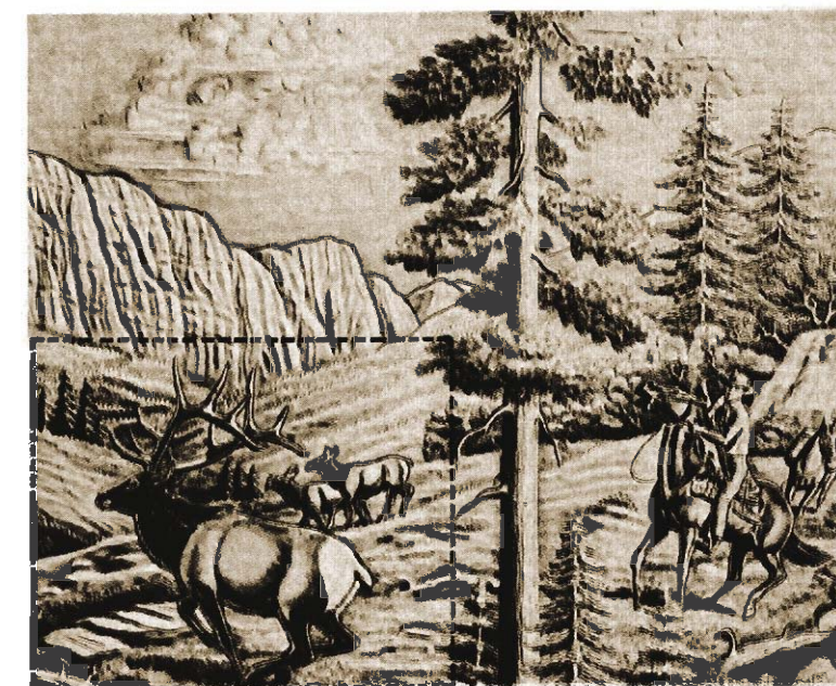
CARVING A LARGE SCENE By Christine Stanley

No. 3. Lesson number three will cover figure carving in some detail. The bull elk is the prominent subject, although the technique will apply generally to much of the scene in this section. The F895 beveler is used to outline and to form the muscle detail. The large F896 beveler is used in much of the same area as the F895. The F896 will produce a matting effect after using the F895. Where hair detail is necessary on the body of the elk — as on such areas as the neck and the coarse hair on the belly and flank — the F902 pointed beveler is used. The F917 is used for the hair detail on the bulky part of the body, by striking lightly and following the normal hair pattern of the animal.