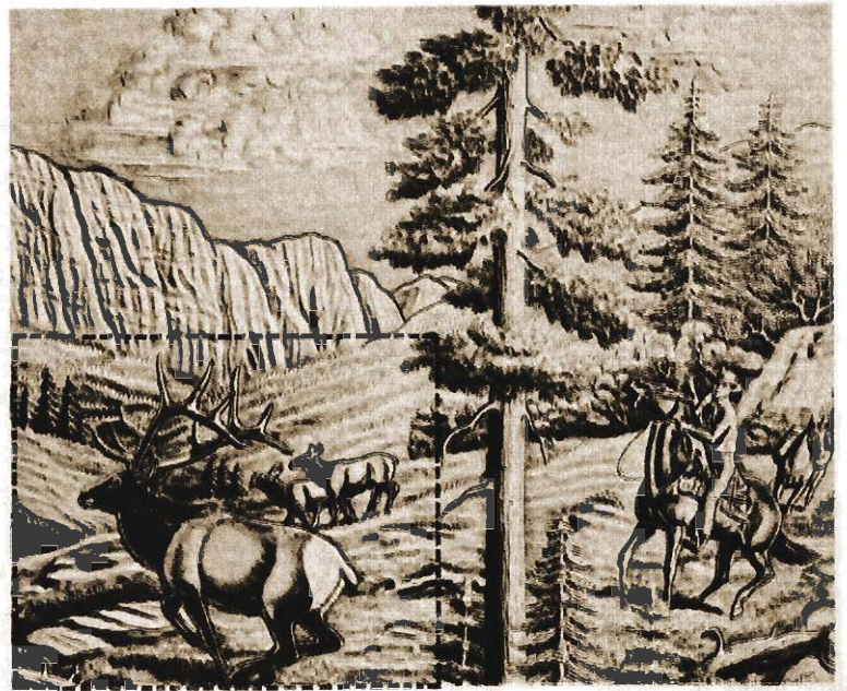
CARVING A LARGE SCENE By Christine Stanley

No. 3. Lesson number three will cover figure carving in some detail. The bull elk is the prominent subject, although the technique will apply generally to much of the scene in this section. The F895 beveler is used to outline and to form the muscle detail. The large F896 beveler is used in much of the same area as the F895. The F896 will produce a matting effect after using the F895. Where hair detail is necessary on the body of the elk — as on such areas as the neck and the coarse hair on the belly and flank — the F902 pointed beveler is used. The F917 is used for the hair detail on the bulky part of the body, by striking lightly and following the normal hair pattern of the animal.