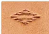
FIGURE STAMP F926D